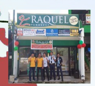
MAJAYJAY BRANCH ADDRESS: 221 Blumit, street Brgy. Origuel, Majayjay, Laguna GRAND OPENING DATE: December 3, 2018

LIPA TM KALAW BRANCH ADDRESS: TM Kalaw St., Brgy. 9, Lipa City, Batangas GRAND OPENING DATE: October 26, 2018