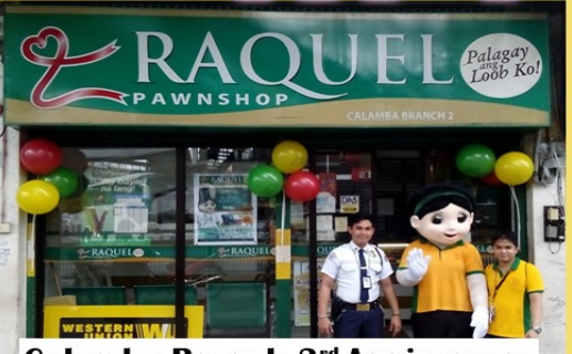
Calamba Branch 3rd Anniversary July 18, 2018