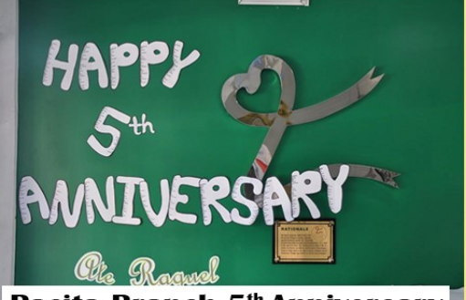
Pacita Branch 5th Anniversary October 22, 2018