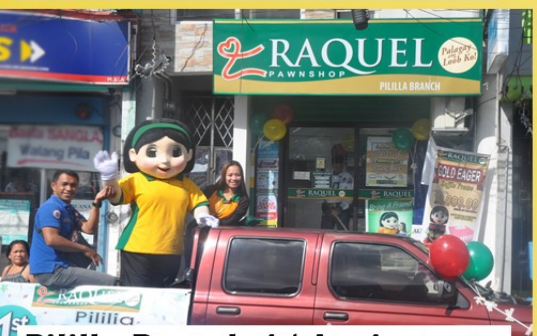
Pililla Branch 1st Anniversary October 16, 2018