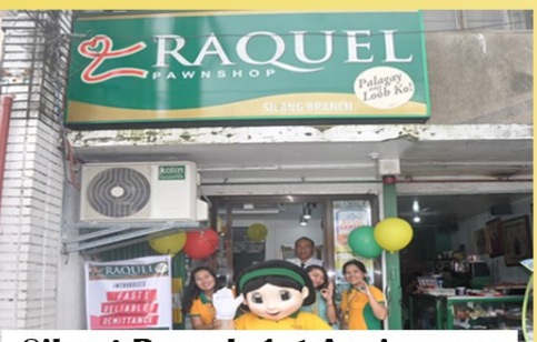
Silang Branch 1st Anniversary September 27, 2018