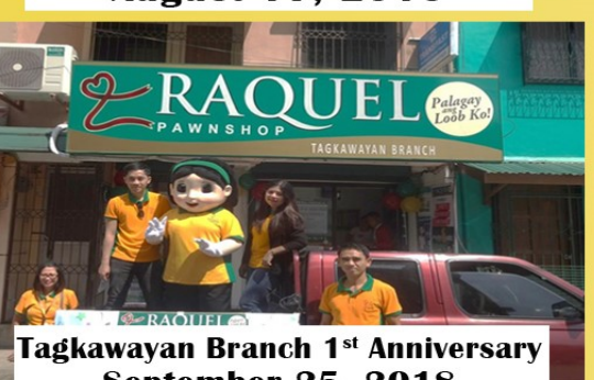
September 25, 2018