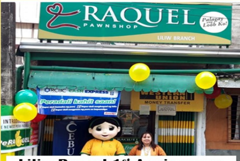
Liliw Branch1st Anniversary December 11, 2018