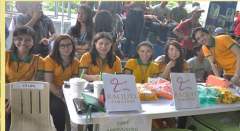
STI Got Talent (Cluster) September 18, 2018