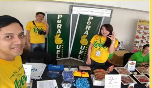
RTIPC IV-A 11th Annual Convention November 9, 2018