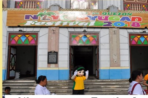
Niyogyugan Festival August 16, 2018