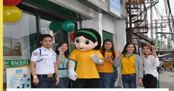
San Mateo Banaba Branch1st Anniversary November 21, 2018