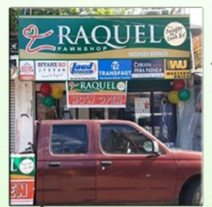
NASUGBU BRANCH ADDRESS: Brias St., Barangay 3, Nasugbu, Batangas GRAND OPENING DATE: November 29, 2018