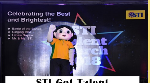
STI Got Talent August 17, 2018