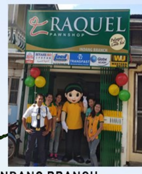
INDANG BRANCH ADDRESS: 246 A. Mabini St., Brgy. 2, Poblacion, Indang, Cavite GRAND OPENING DATE: July 19, 2018