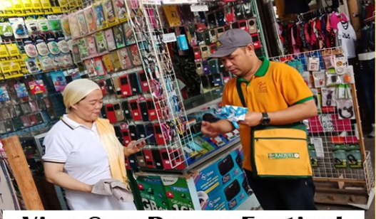
Viva San Roque Festival August 13, 2018